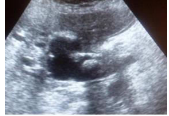
Fig-2: Dilated gall bladder, common duct and intrahepatic biliary ductules due to presence of large mass lesiondiagnosed on CT as cholangiocarcinoma. It was further confirmed on histopathology as cholangiocarcinoma.